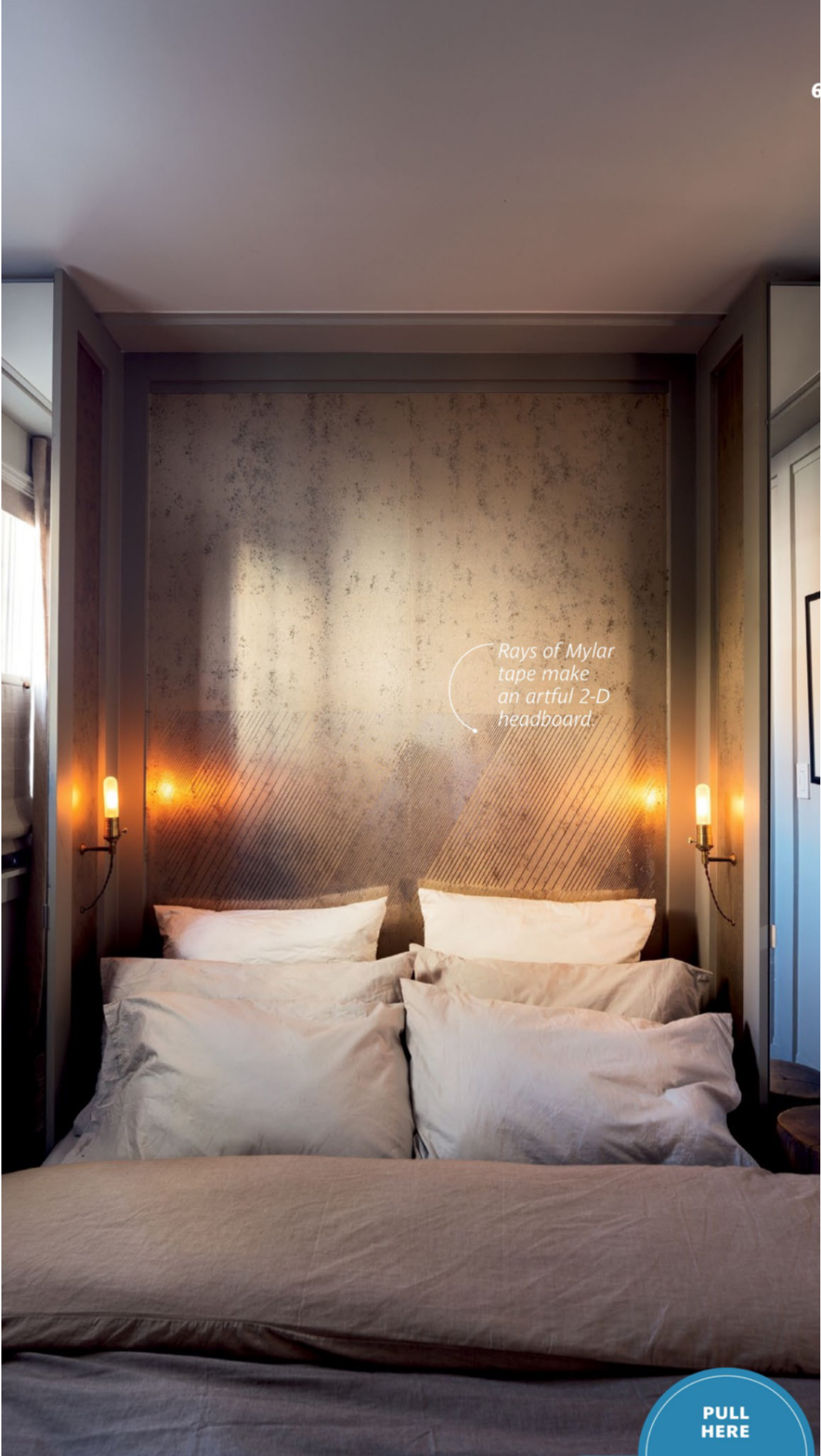
Rays of Mylar tape make an artful 2-D headboard.