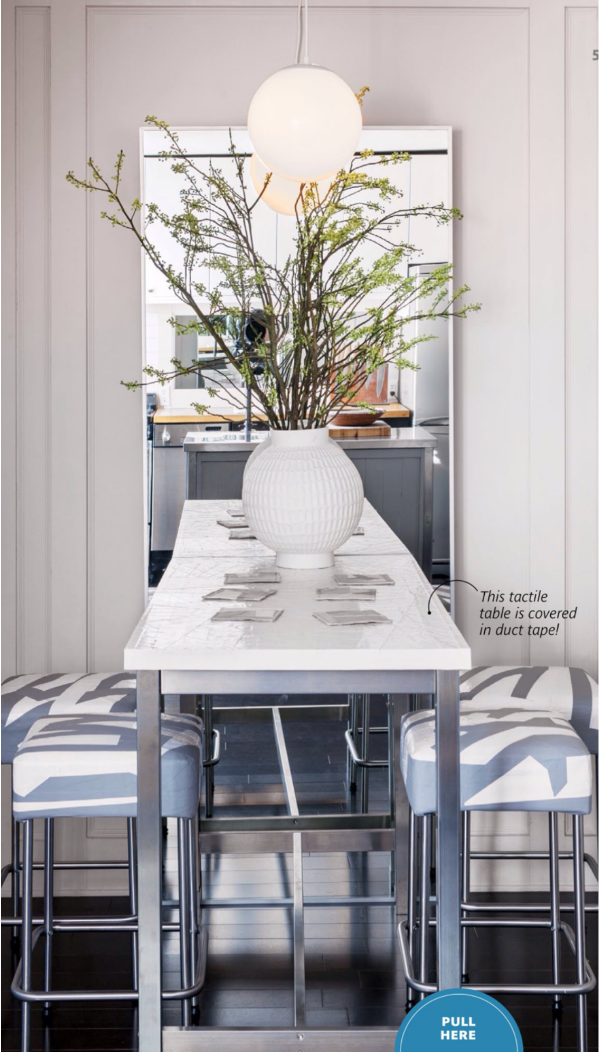
This tactile table is covered in duct tape!